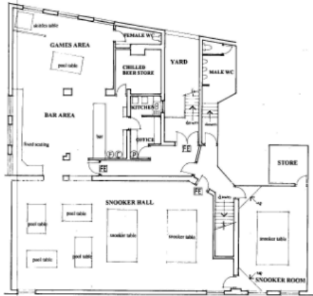
EXISTING 1 ST FLOOR